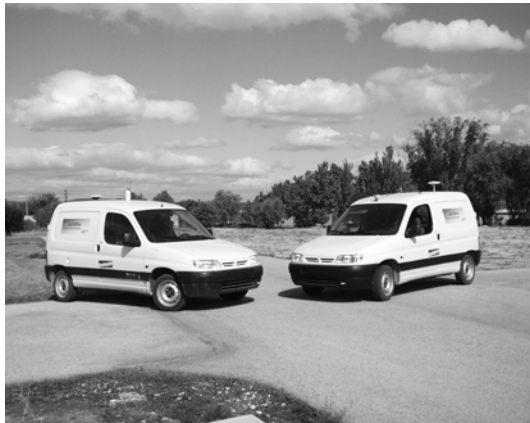
Figure 1: Citroën Berlingo commercial prototypes.